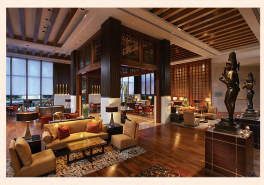
Lobby Lounge at The Leela Mumbai

To not just satisfy our guests, but delight them. To show the warmth and grace unique to Indian hospitality. To set a new global standard of service in which wishes are not simply granted, but anticipated.