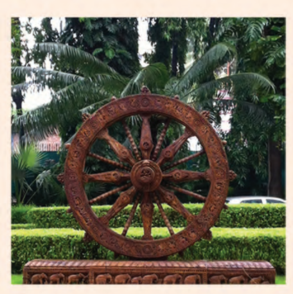
Entrance of The Leela Mumbai